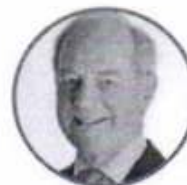
Lord Peter Lilley Member of the House of Lords, United Kingdom