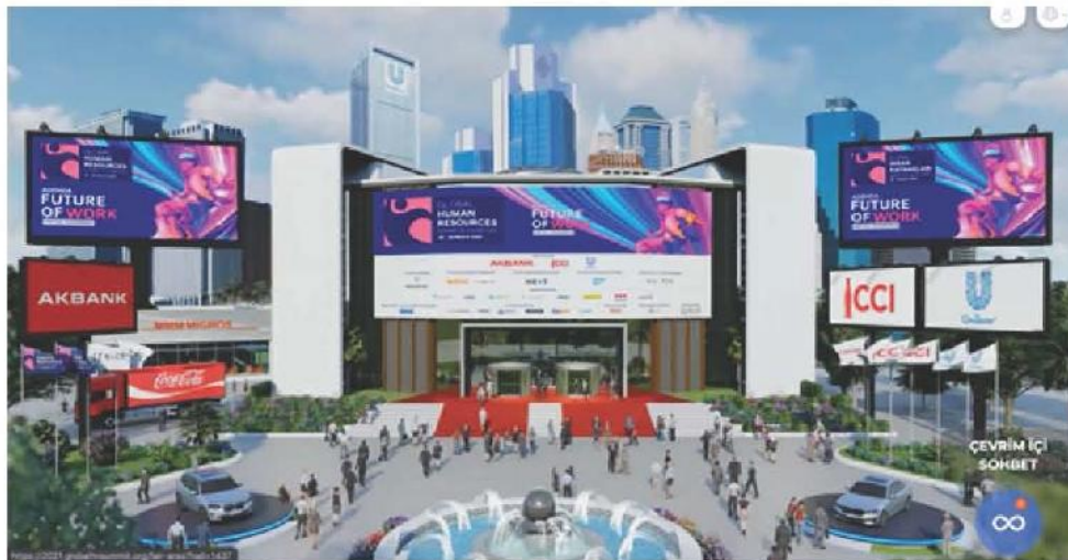
IDA 2021 main landing page with sponsor logos (example)

Please get in touch if you are interested in one of our sponsorship packages with additional pre-event, event and post-event marketing measures.