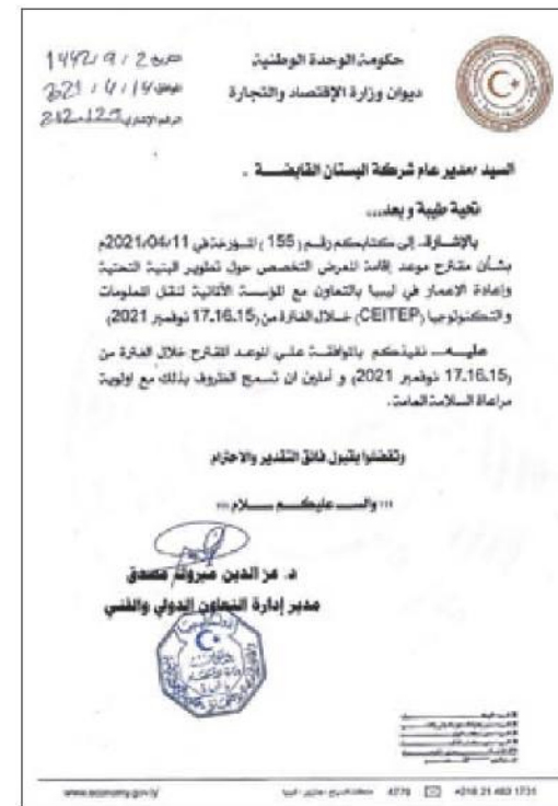
Invitation letter by the Libyan Government

ITIDA has been invited by the Libyan Government to concentrate its first online trade fair on "Reconstruct Libya". Many Libyan companies and decision makers will be obliged to visit the trade fair.