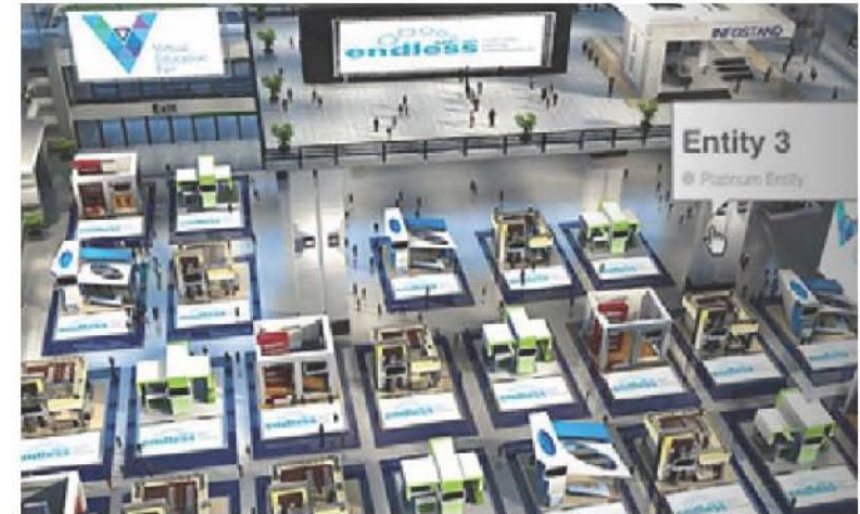
IDA 2021 Online Exhibition Hall (example)

Create private survey at your booth and get feedback from your visitors. visitors can leave you their business cards with contact information at your stand